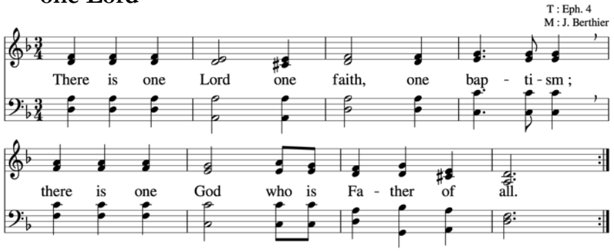
Un seul Seigneur, une seule foi, un seul baptême, un seul Dieu qui est Père de tous.

5. Second vigil: Response after 1 Cor 1:10-13: "There is one Lord"